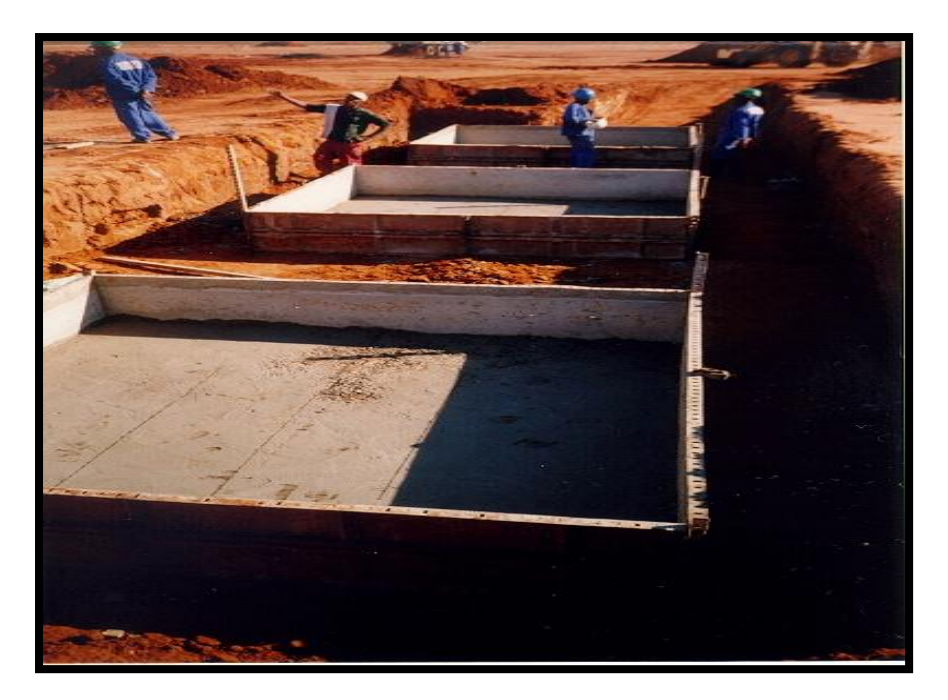
Figure 3: Construction of transformer foundations