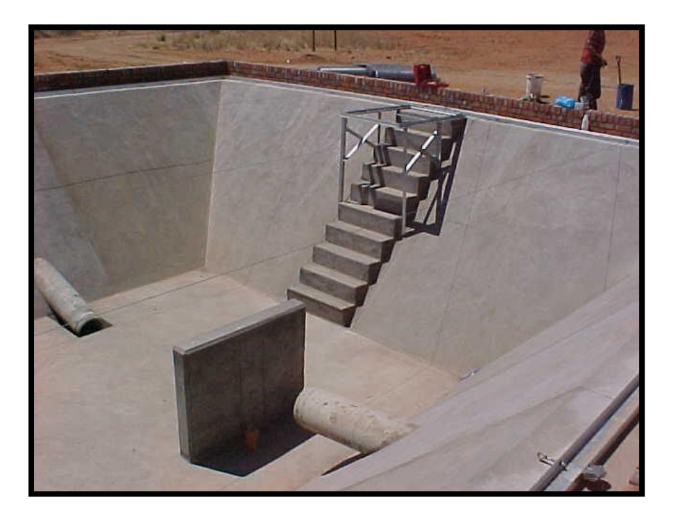
Figure 4: Construction of a oil holding dam