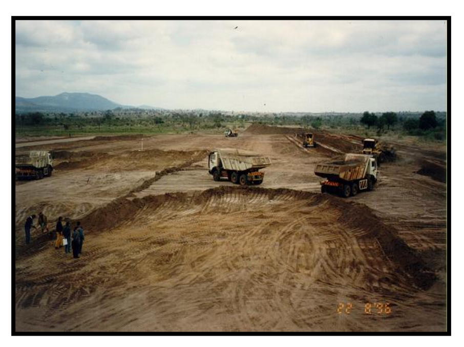
Figure 2: Typical substation terrace and levelling