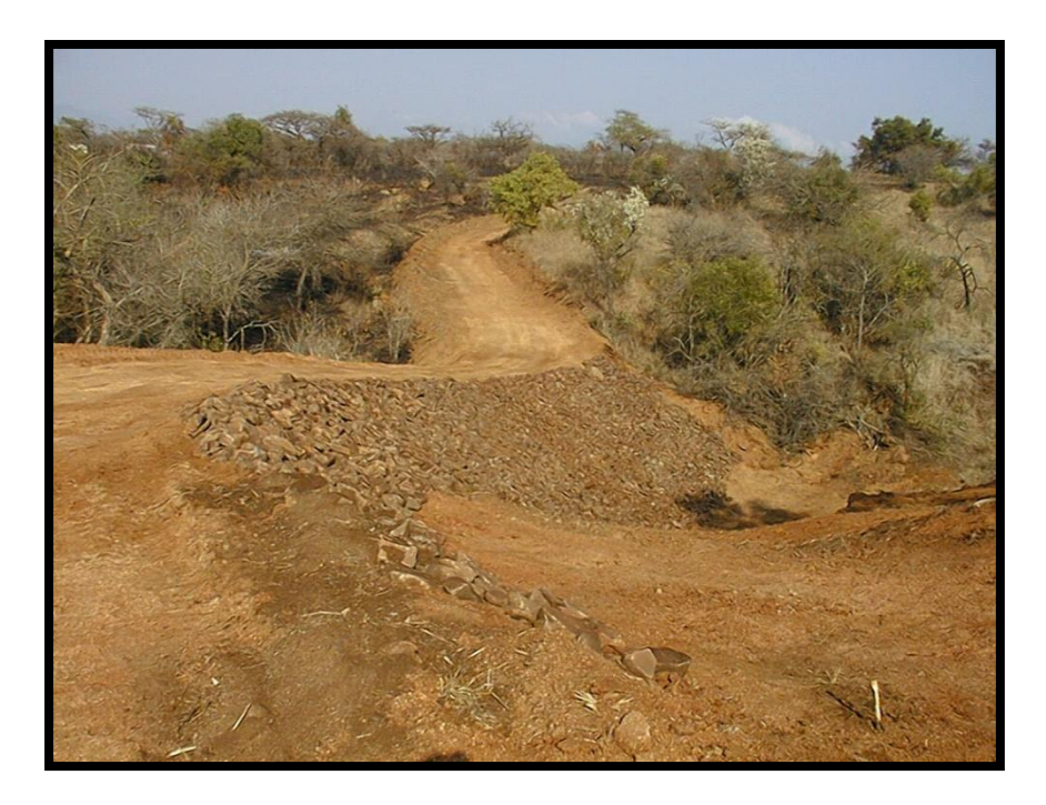
Figure 1: A typical special access road